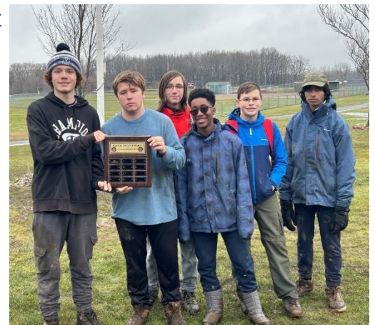
Picture of the 1st place patrol. The plaque they are holding was donated by the post last year.